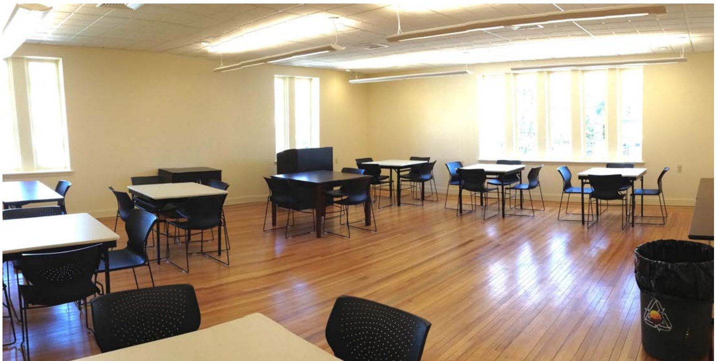
THE SECOND FLOOR MEETING ROOM

In anticipation of the June 6th building tours, I thought it would be useful to provide a few photos of the spaces, new finishes and amenities now provided in what we now call "Duggan Hall":