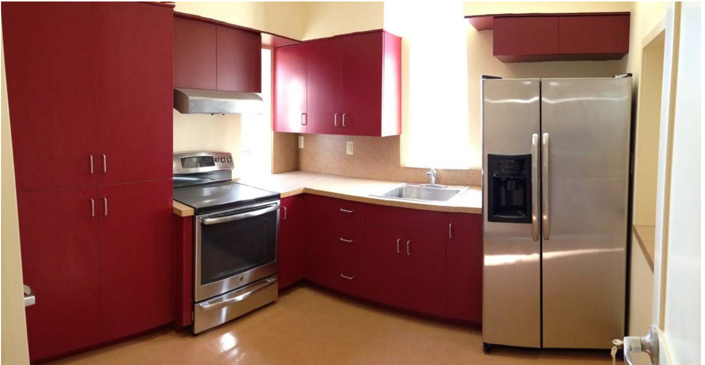
THE NEW KITCHEN