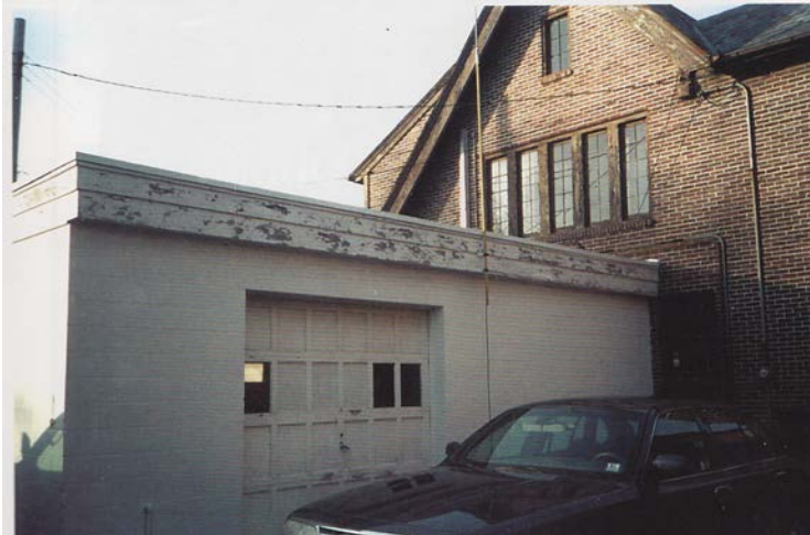
THE OLD EXTENSION