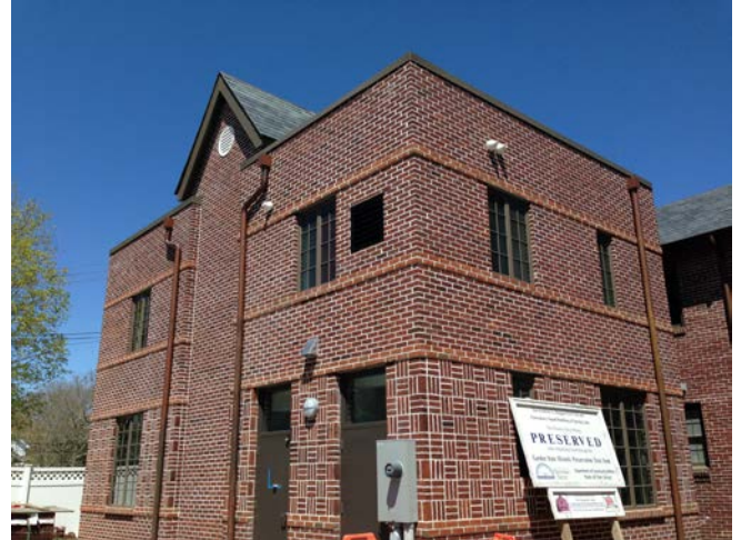
THE NEW EXTENSION

Needless to say, the members of the Preservation Alliance are very proud of the results achieved in our and our many partners efforts to save, restore, expand and improve the historic Duggan Memorial First Aid & Emergency Building of Spring Lake. We see this as a wonderful example of the importance of our mission, to recognize and save the historic buildings in Spring Lake, and we all look forward to celebrating this success on June 6th.