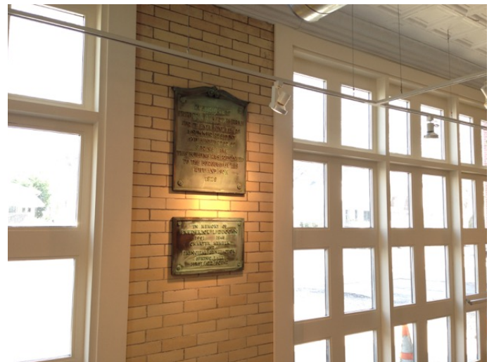
THE ORIGINAL BUILDING AS SEEN IN THE 1930'S ALONG WITH THE ORIGINAL PLAQUES DEDICATING THE BUILDING TO THE DUGGAN FAMILY