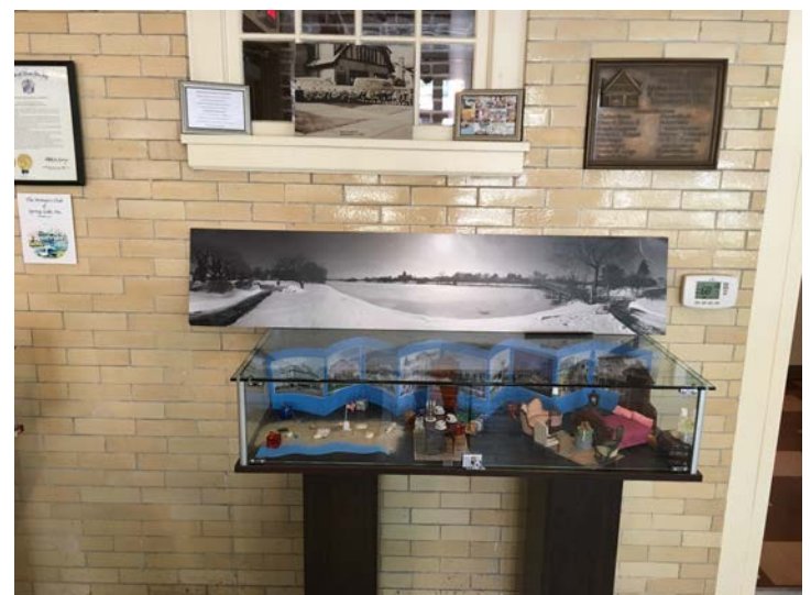
THE FIRST FLOOR INTERPRETIVE CENTER