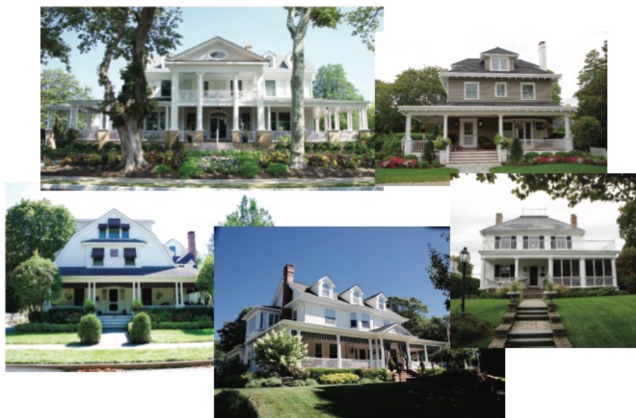
THE PRESERVATION ALLIANCE OF SPRING LAKE 2016 AWARD WINNING HOMES