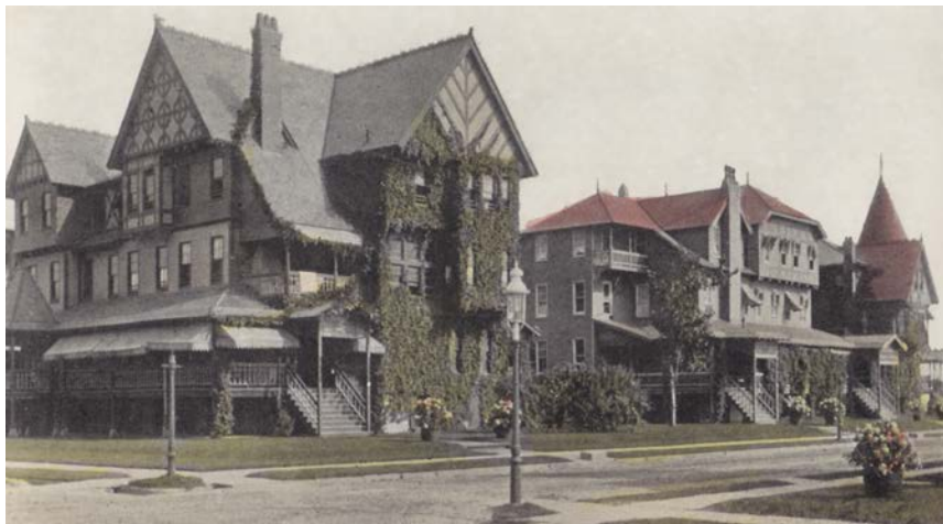
Hastings Square cottages, probably the Sussex or Urie Cottages as seen from the Ocean House

By the late 1920's the Essex and Sussex was an impressive competitor to the “New” Monmouth Hotel in popularity and reputation. The two grand ladies of Spring Lake were also valued by ships at sea for helping to determine position relative to the coastline.