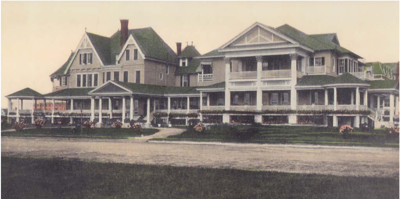
Mrs. Urie's Essex and Sussex

After the fire Mrs. Urie built two large attached “Surf Cottages” facing the ocean and named them the Essex and Sussex. These buildings were moved around the corner to Essex Avenue just before the present colonial revival structure also named the Essex and Sussex Hotel took its place on the ocean front in 1914.