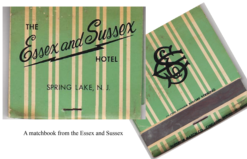
A matchbook from the Essex and Sussex