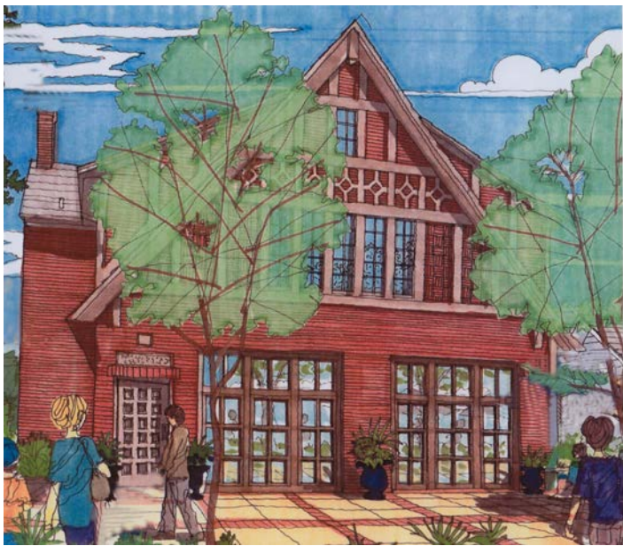
Rendering of the restored Frederic A. Duggan Memorial First Aid Squad Building

With the receipt of a federally-funded Monmouth County Community Block Grant and a Monmouth County Historical Commission Grant to be used as part of the matching funds, the community must raise only 1/3 of the amount needed to bring this nationally recognized historic structure back to its place at the heart of Spring Lake. We have already come so far. Please mark your calendars so you don't miss the chance to participate in a great evening, and to make your family members and loved ones a permanent part of Spring Lake history.